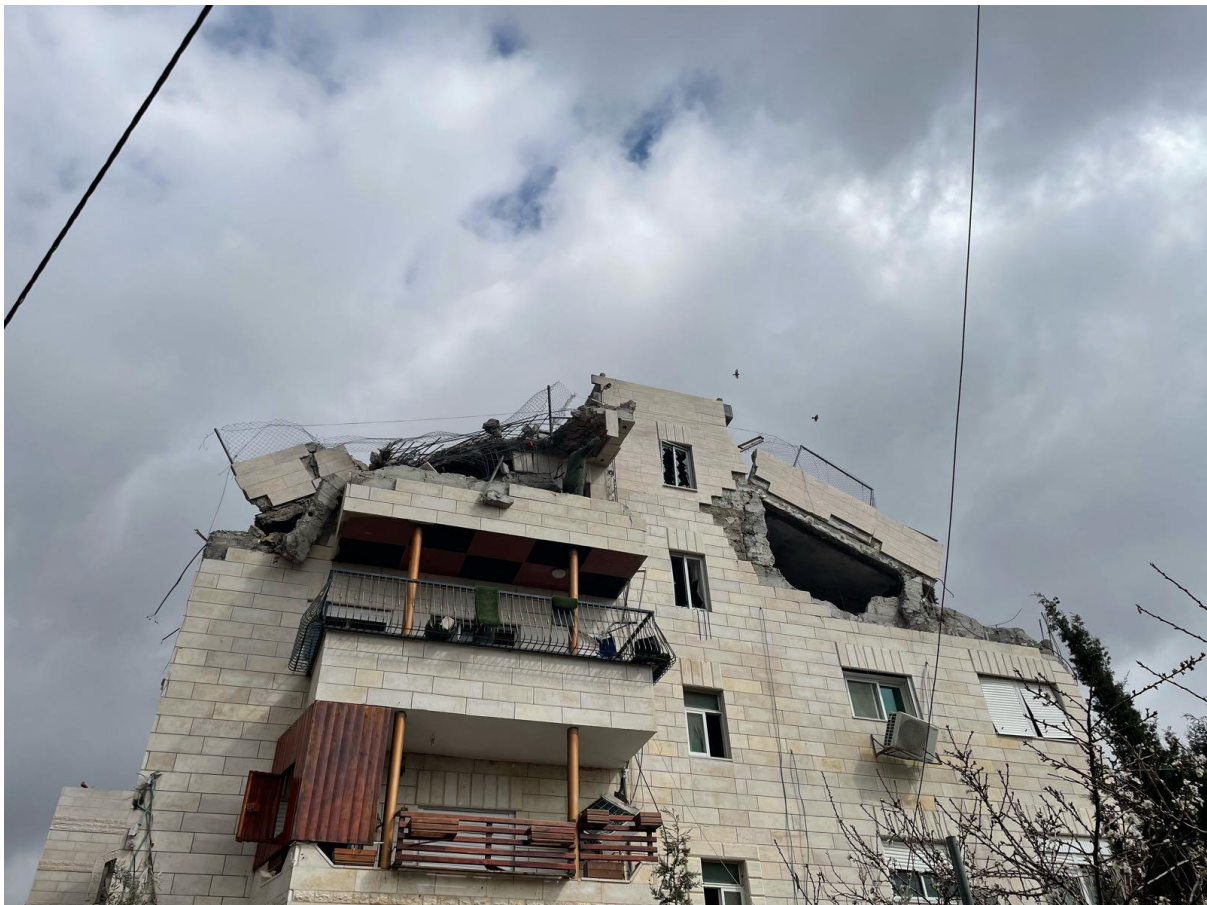
Punitive demolition by explosives - Residential apartment- Hebron city 16 February 2023