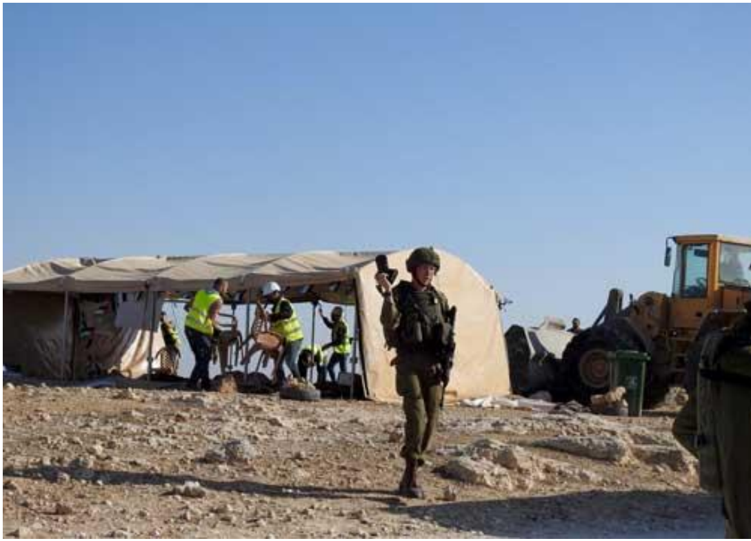
Demolition of the solidarity tent in Umm Fagarah, 'Eid Hazalin

Resisting Apartheid, Building a Shared Democracy