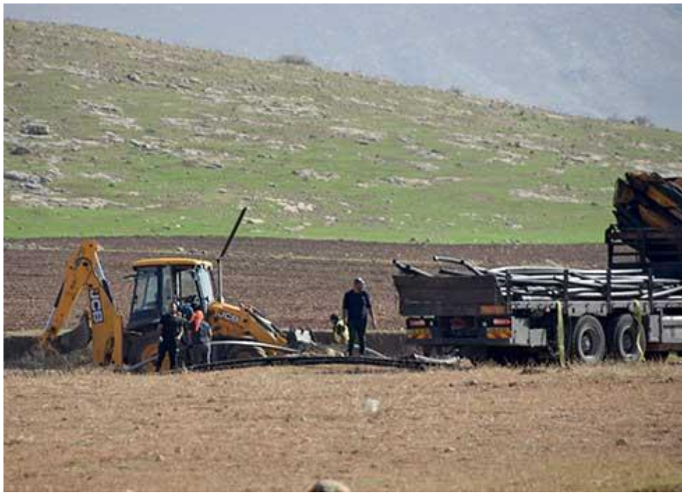
Confiscation of the water pipe in Khirbet 'Atuf. 28 Nov. 2021