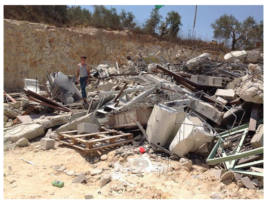
2 August, 2022: house demolition, Sabastiya (Nablus)