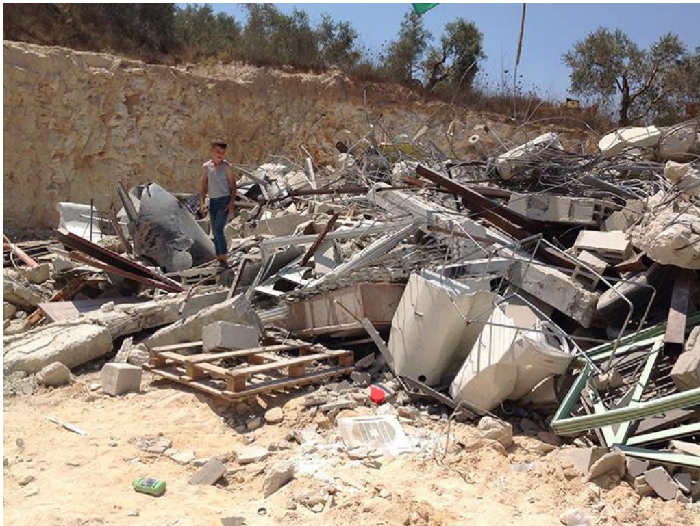
2 August, 2022: house demolition, Sabastiya (Nablus)